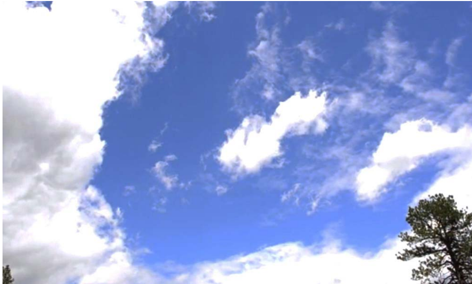
Cloud dispersion due to AEE