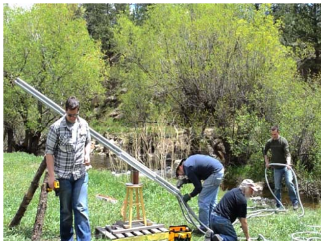
The team assembles the AEED. The river is on the right.